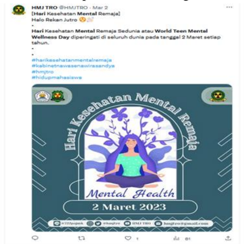
Figure 2. Tweet about Youth Mental Health Day by HMJTRO

though it included the hashtag #teenmentalhealthday. Unfortunately, that hashtag was the only one, because no other netizens retweeted or amplified the hashtag